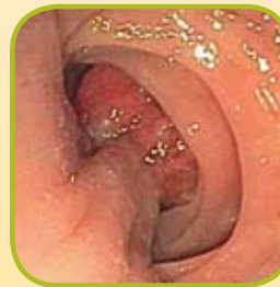
Polyp on Stalk